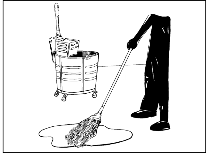
Figure 2. Applying the Statguard® Low Residue Floor Stripper with a cotton mop