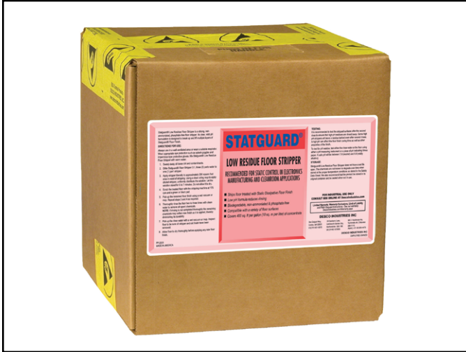
Figure 1. Statguard® Low Residue Floor Stripper